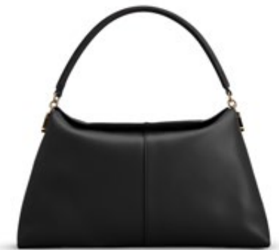
15 - B