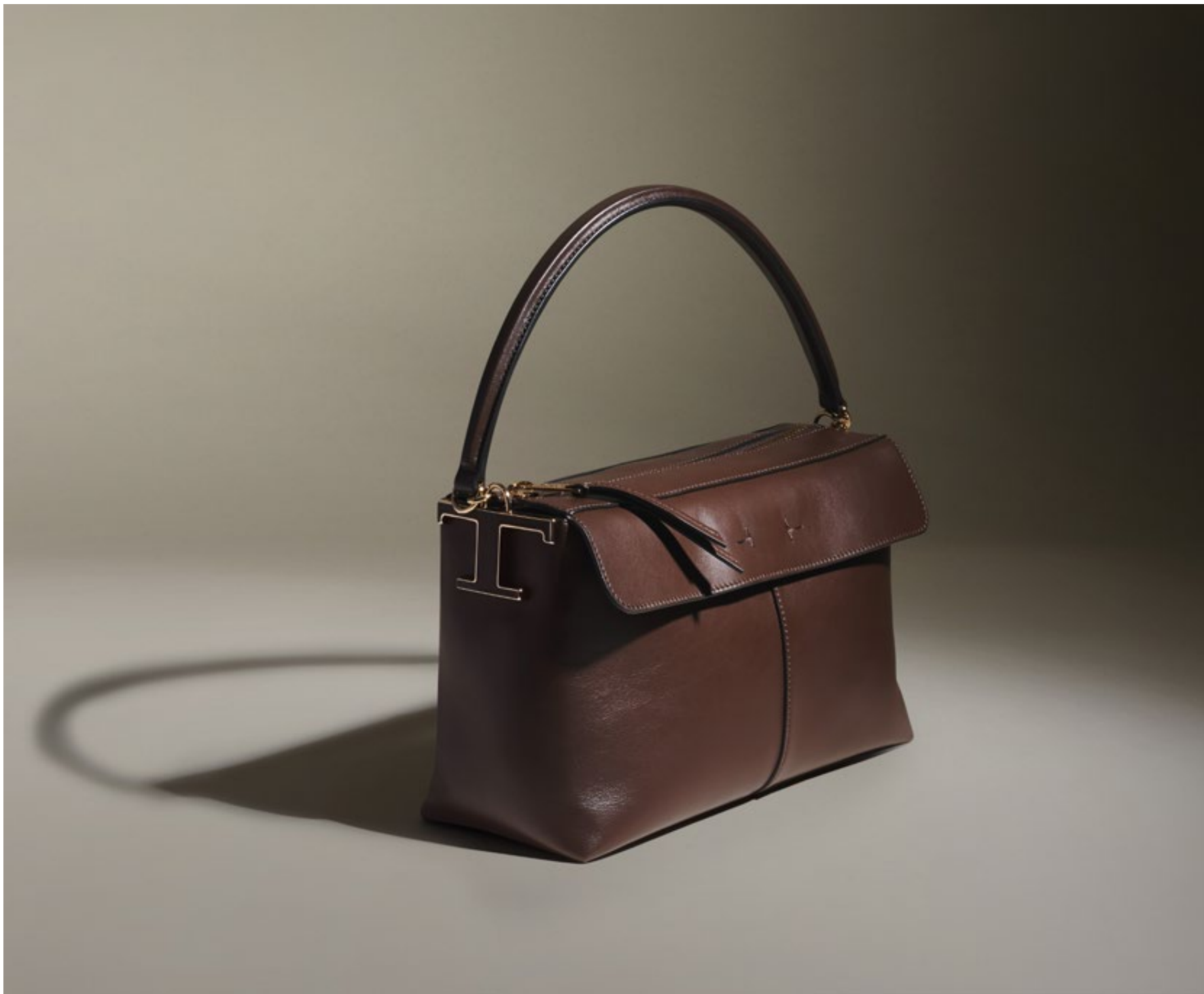
TOD'S T CASE