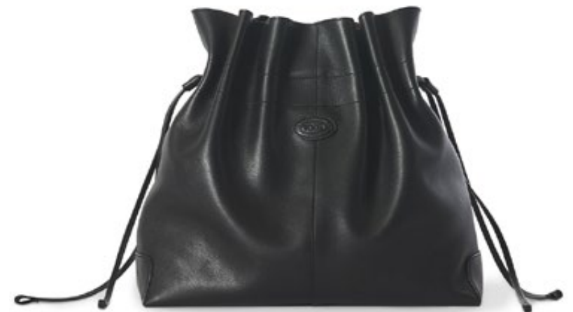
10 - B