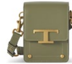
17 - A