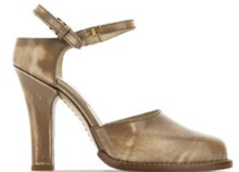
O4 - C