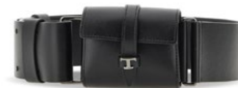
19 - A