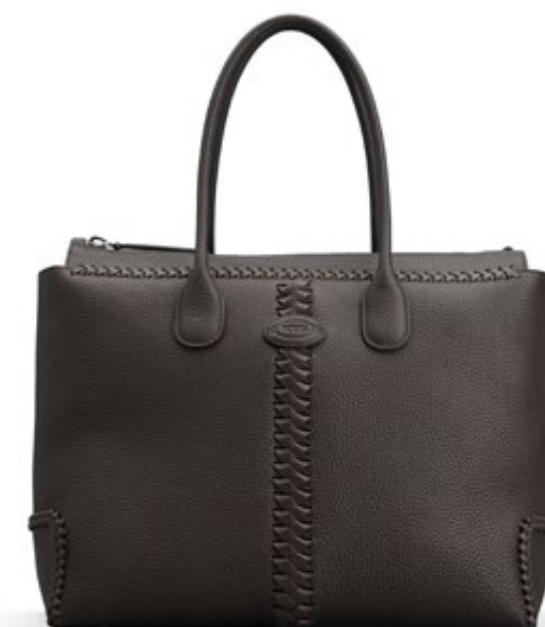
09 - B