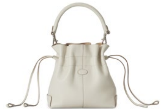
II - B