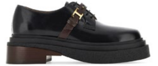
06 - A