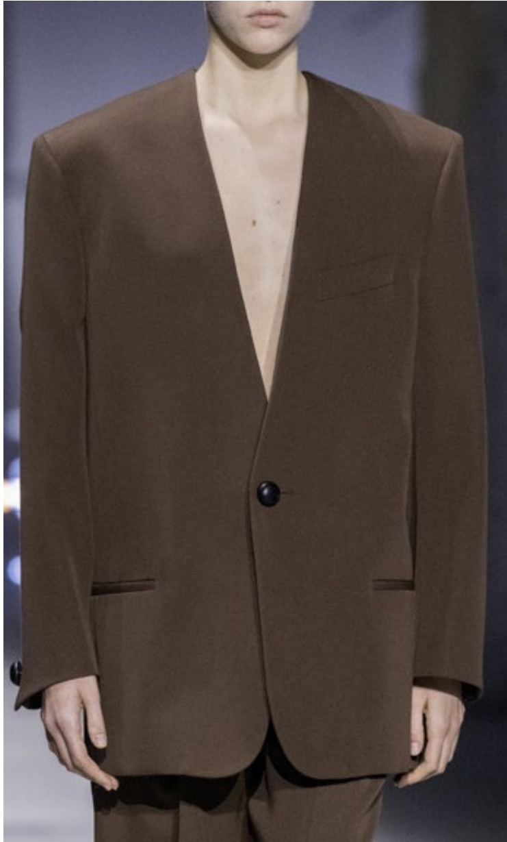
READY TO WEAR