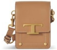
17 - B