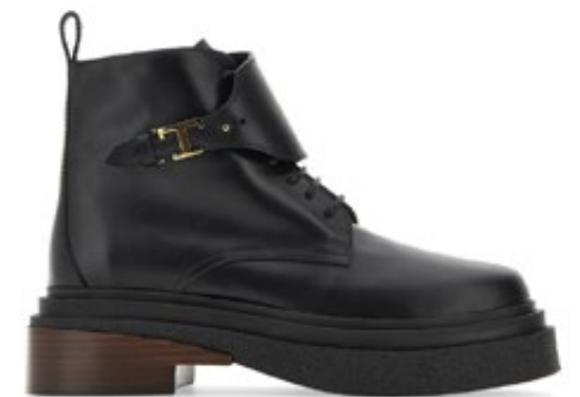
O7 - A