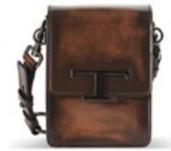
17 - D