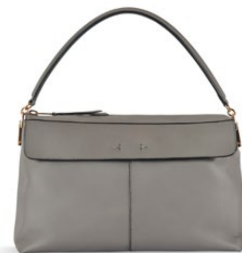
14 - A