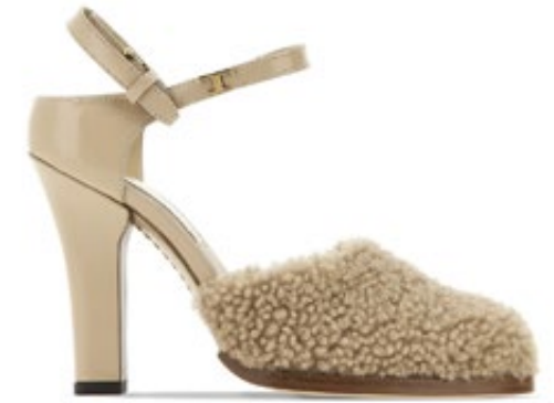
O5 - A