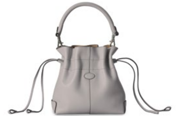
II - A