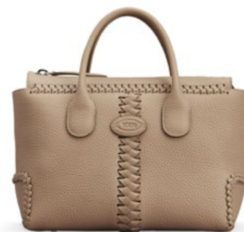
09 - A