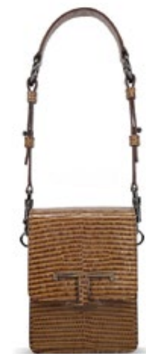
18 - A