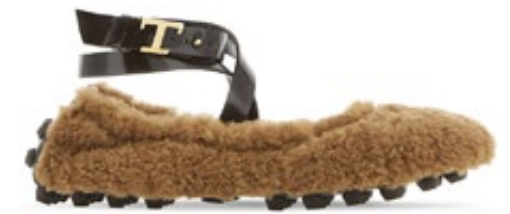
OI - C