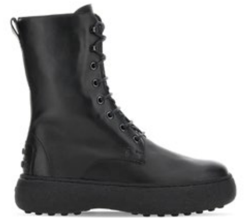
O3 - B