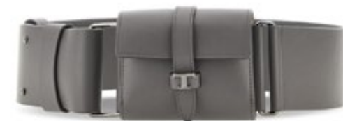
19 - C