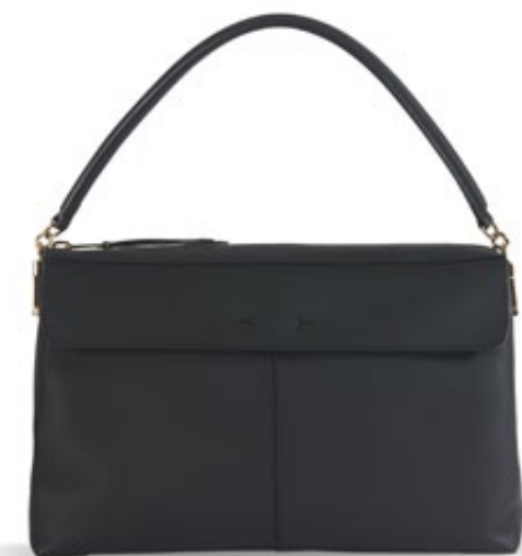
14 - B