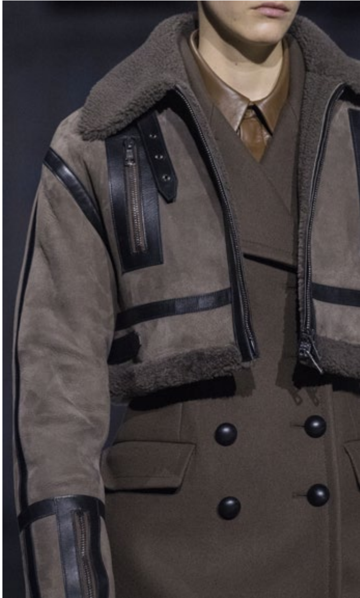
READY TO WEAR