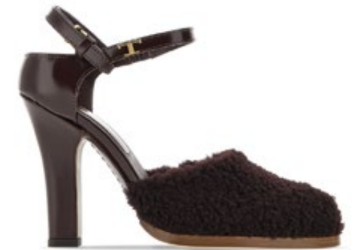
O5 - B