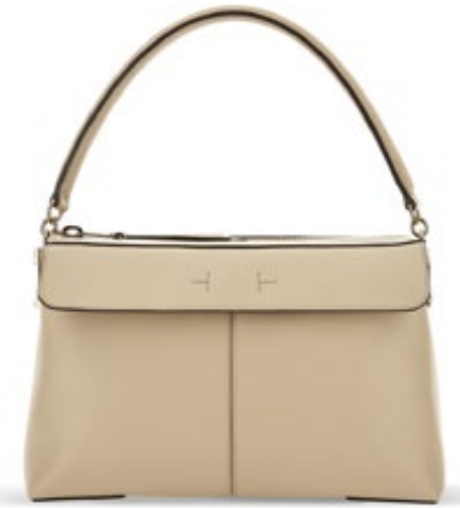
12 - A