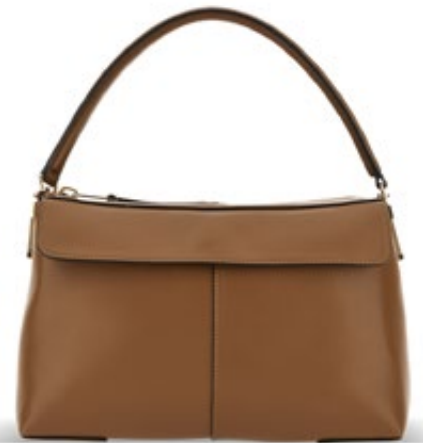
12 - B