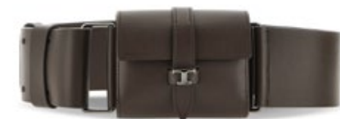
19 - B