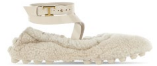
OI - A