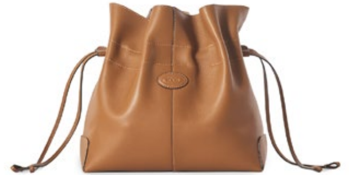
10 - A