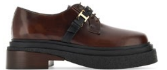
06 - B