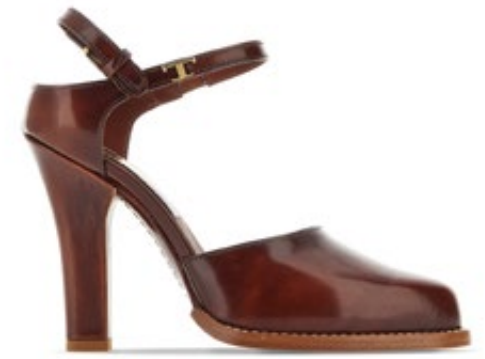
O4 - A