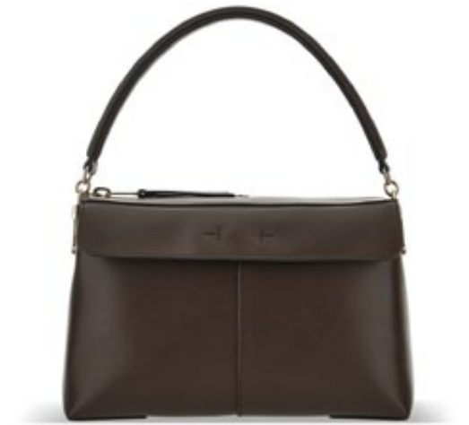
13 - A