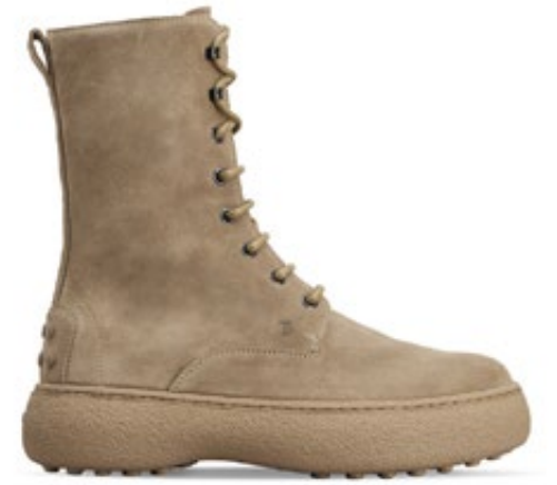
O3 - A