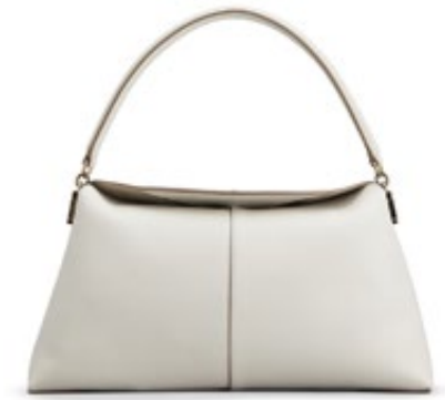
15 - A