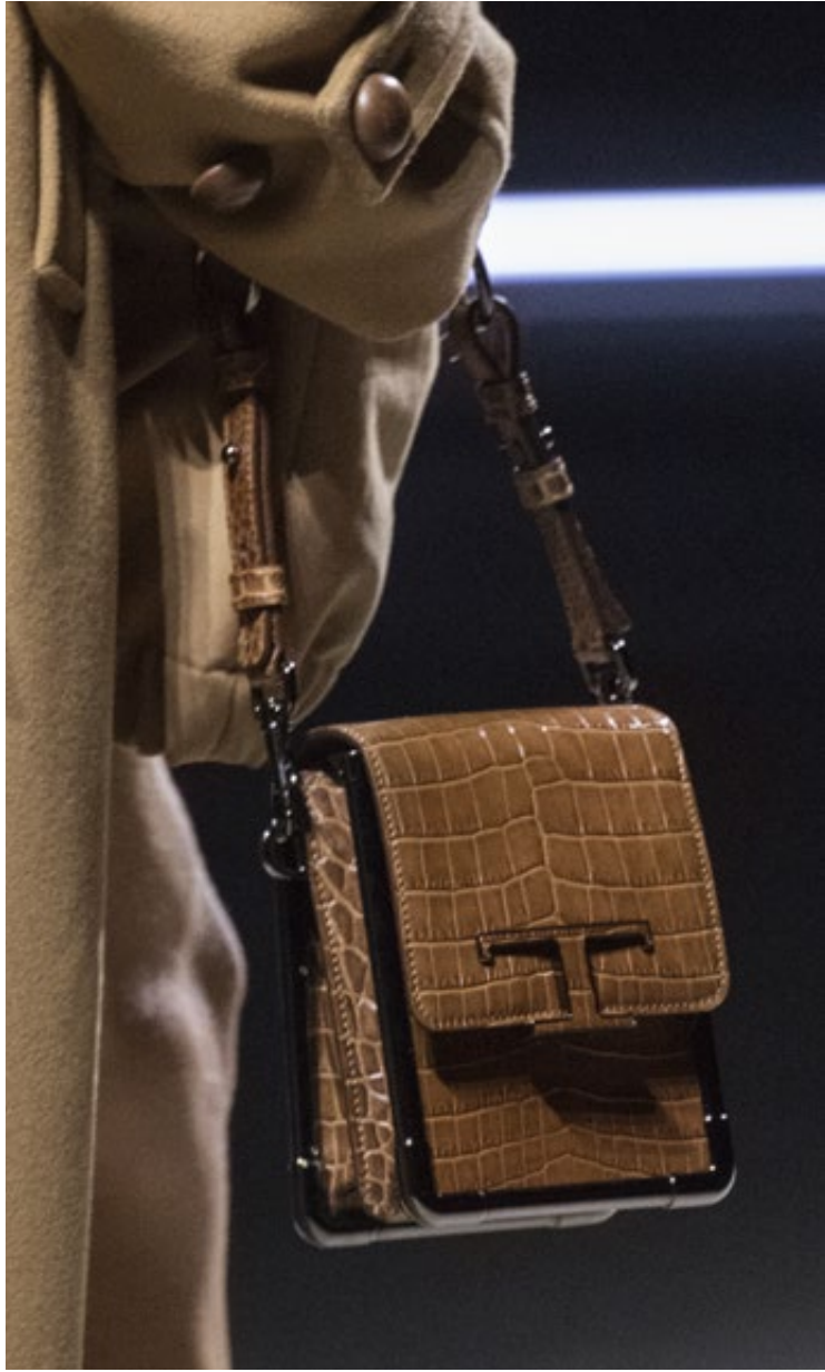
READY TO WEAR