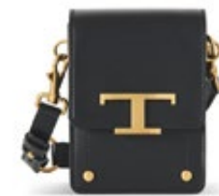
17 - C