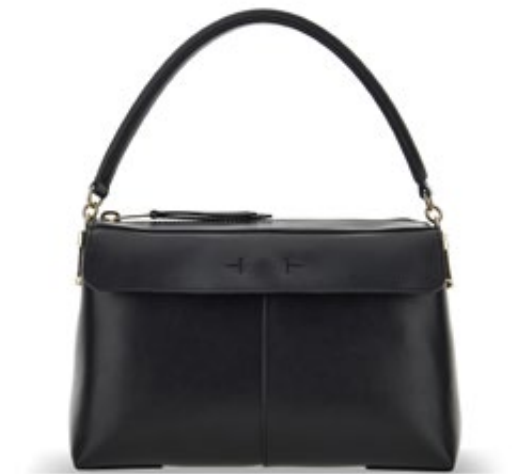
13 - B