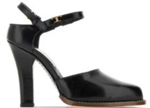
O4 - B