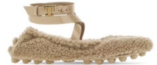
OI - B