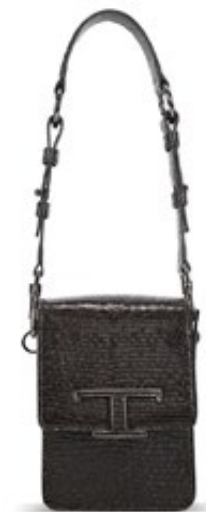
18 - B