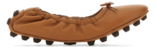
OI - B