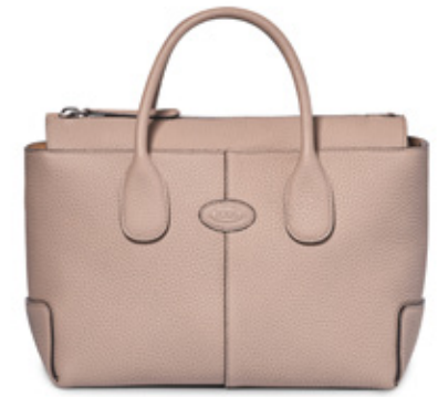
09 - A