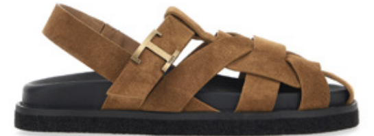
06 - B