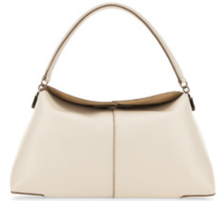
12 - A