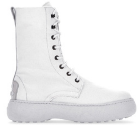
O4 - A