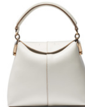
14 - B