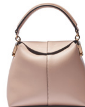
14 - C