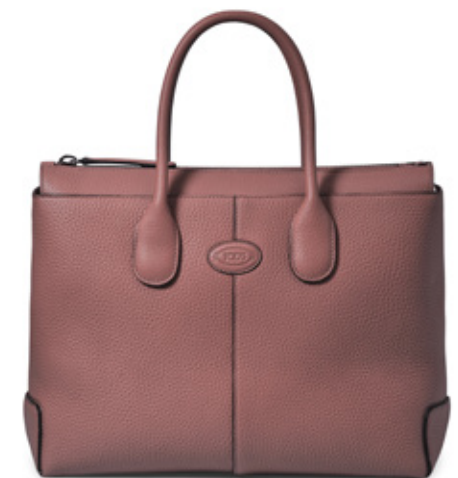
09 - C