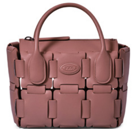
10 - B