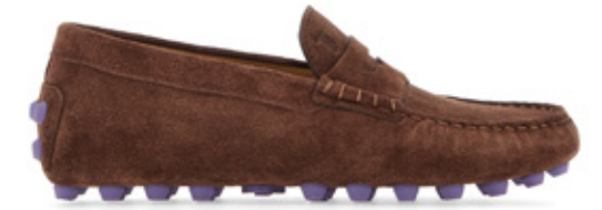
O3 - A