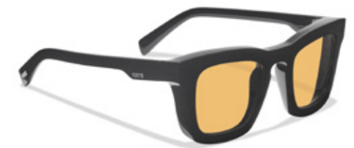
17 - C