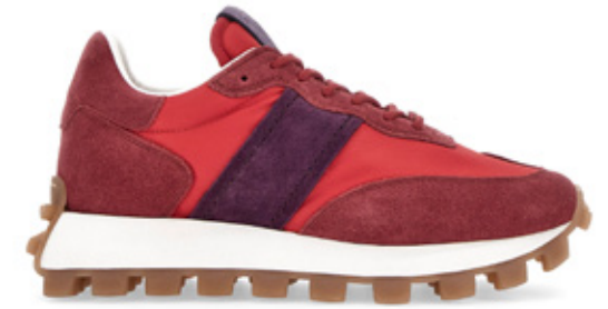
O8 - A