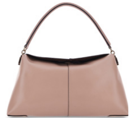
12 - B