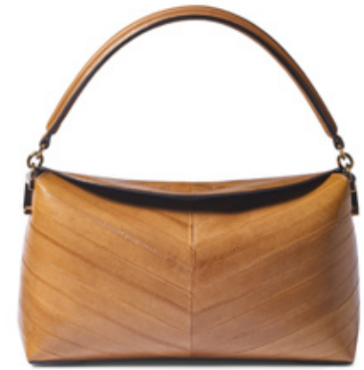
13 - A