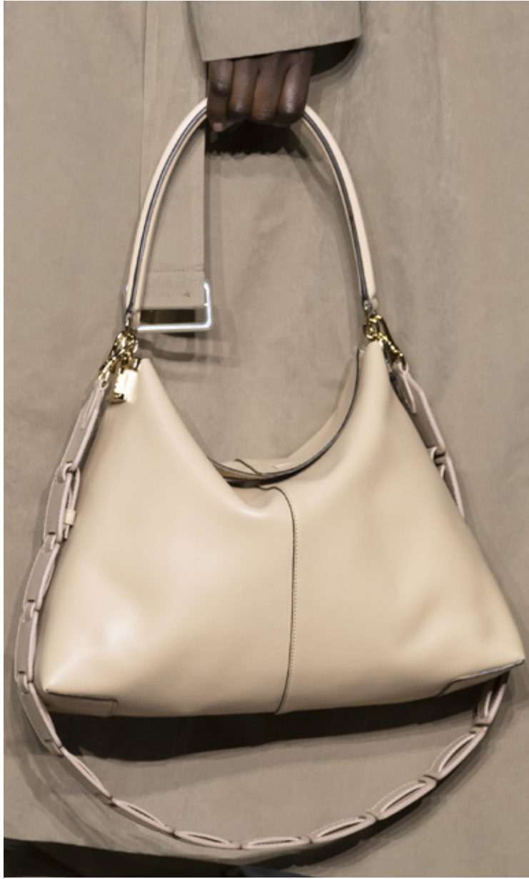
READY TO WEAR