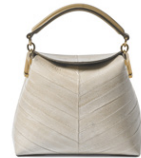
14 - A