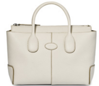
09 - B