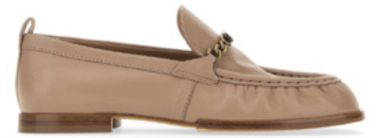
O5 - A