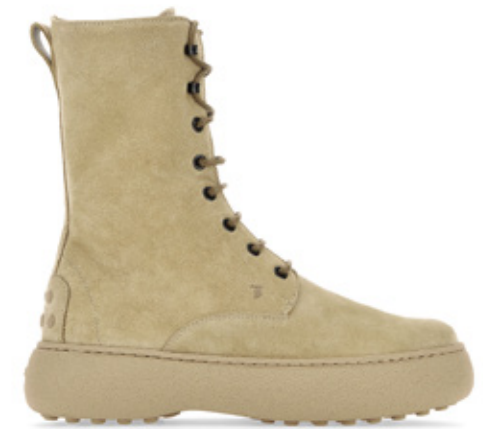
O4 - B