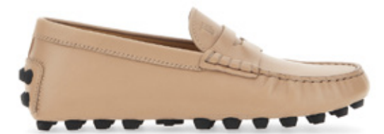
O3 - C