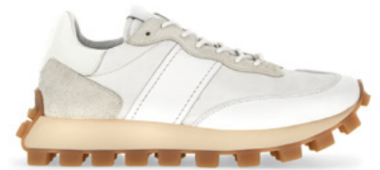
O8 - C