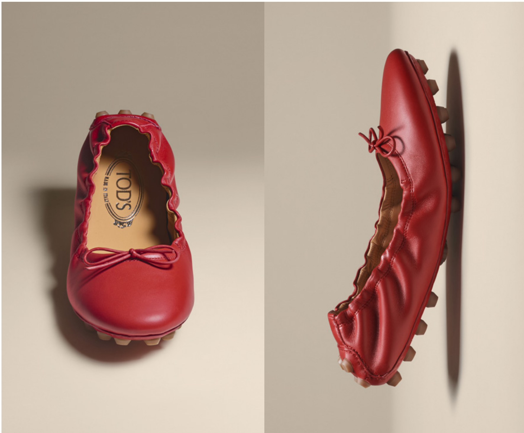
TOD'S BUBBLE BALLERINA