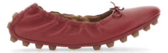
OI - A