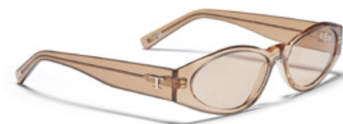
16 - B