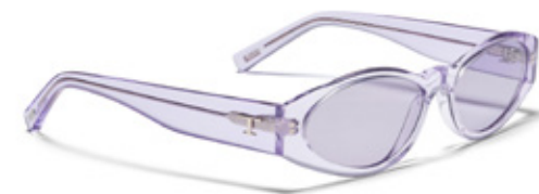
16 - A