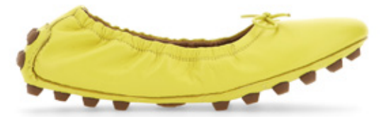
OI - C