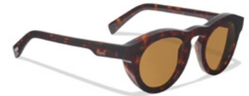
17 - B