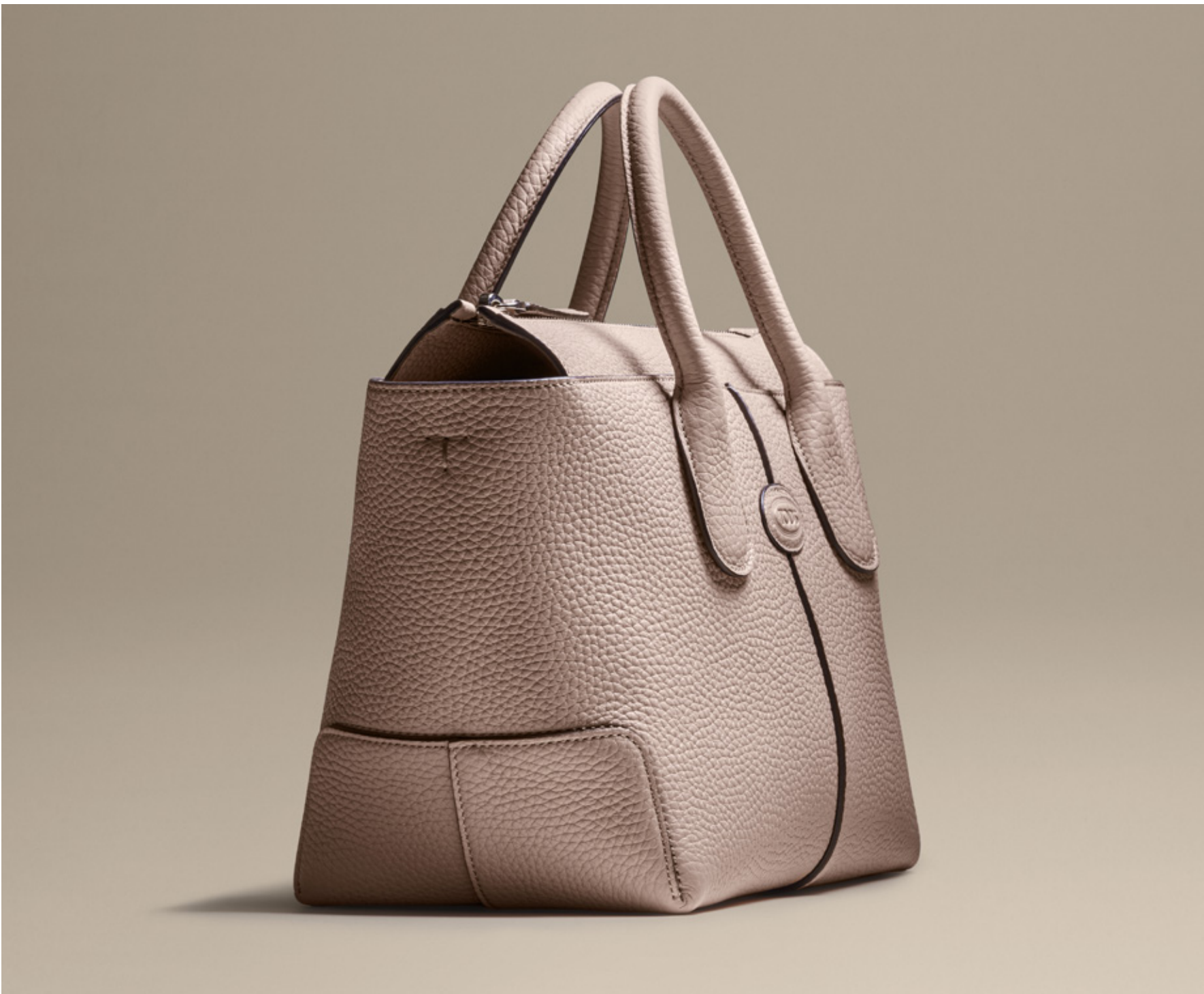
TOD'S DI BAG