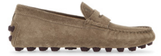
O3 - B