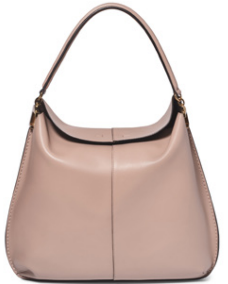
15 - B