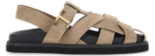
06 - A