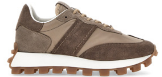
O8 - B