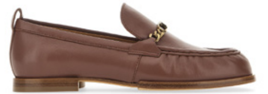
O5 - B