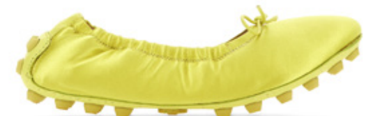
O2 - B