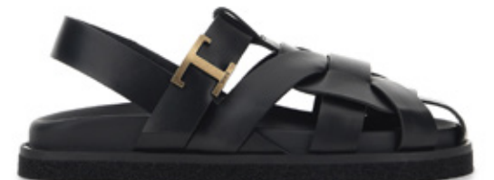
06 - C