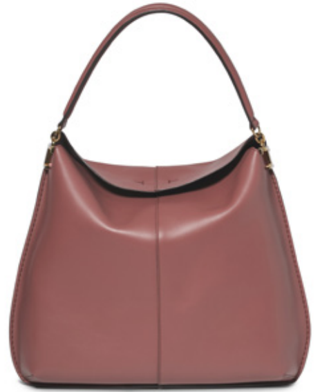
15 - A