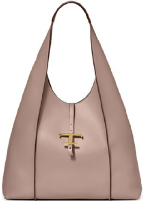
II - A