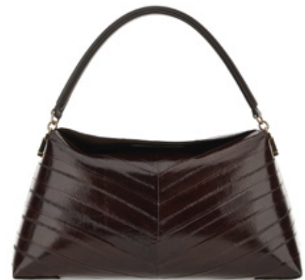
12 - C