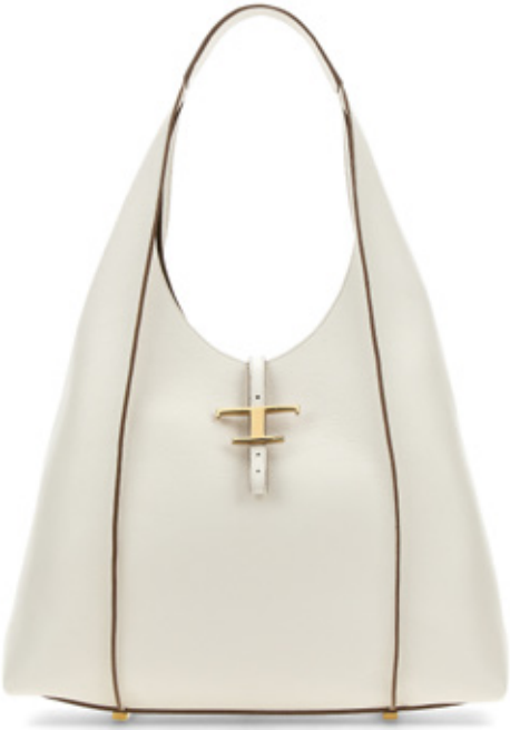
II - B