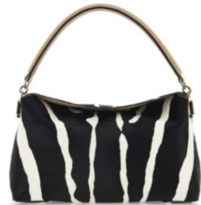
13 - B