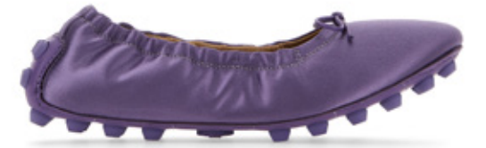
O2 - A