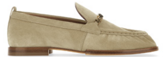
O5 - C