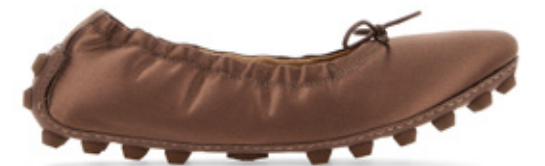
O2 - C