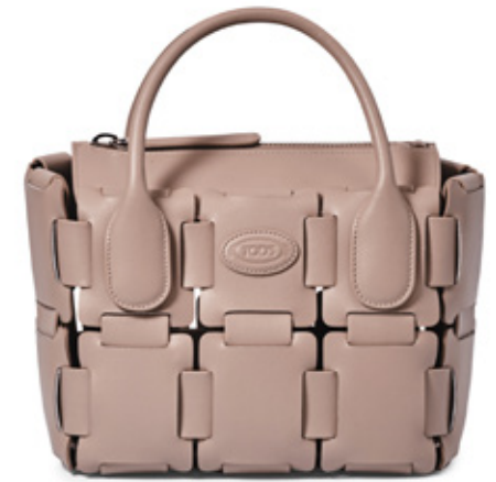
10 - A